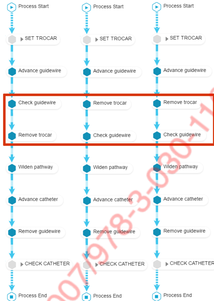
Fig. 3. Process model of student 12F67F in PRE (left) and POST (center), and a generic expert EXP (right). Activities in set trocar and check catheter phases are clustered for the sake of readability (they show no difference in order between PRE, POST and EXP). Activity names are shortened and both action and checking activities are shown. Regarding O2.1 , the PRE model shows the student checked the guidewire and then removed the trocar; however, it is desirable to do these activities in the opposite order, because removing the trocar may affect the position of the guidewire. Regarding O2.2 , POST model is able to capture that the student learned to perform the activities in the right order, and the process match exactly the reference process for the procedure performed by the EXP ( O2.3 ).