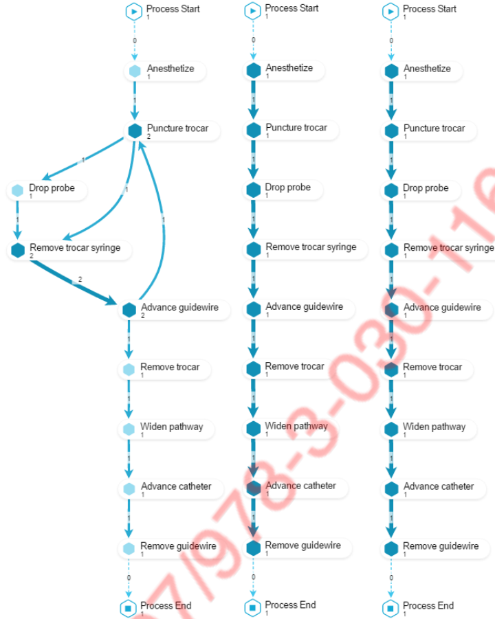
Fig. 2. Process model of student 16F69F in PRE (left) and POST (center), and a generic expert EXP (right). Numbers show activity frequency per case. Activity names are shortened and only action activities are shown for readability reasons. Regarding O1.1 , the PRE model shows rework during the phase of venous puncture with trocar: the student unsuccessfully performs a first trocar installation, then perform a successful one on the second iteration. Moreover, during the second iteration, the probe is not properly dropped (in the sterile zone) closing the door for a possible third iteration without sterilizing everything again. Notice that, the exact path followed in each iteration can be analyzed using the case animation feature of the tool. Regarding O1.2 , POST model is able to capture that the same student does not perform any rework, and the process match exactly the reference process performed by the EXP ( O1.3 ).